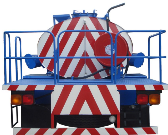
Rear view Optional item : Hose Reel