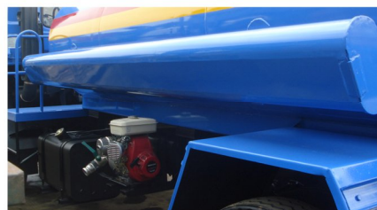
Side Mount Engine Pump Optional item: Hose Carrier