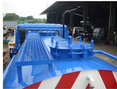
Walk way & Manhole