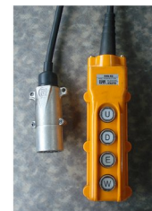
Wired Remote Control